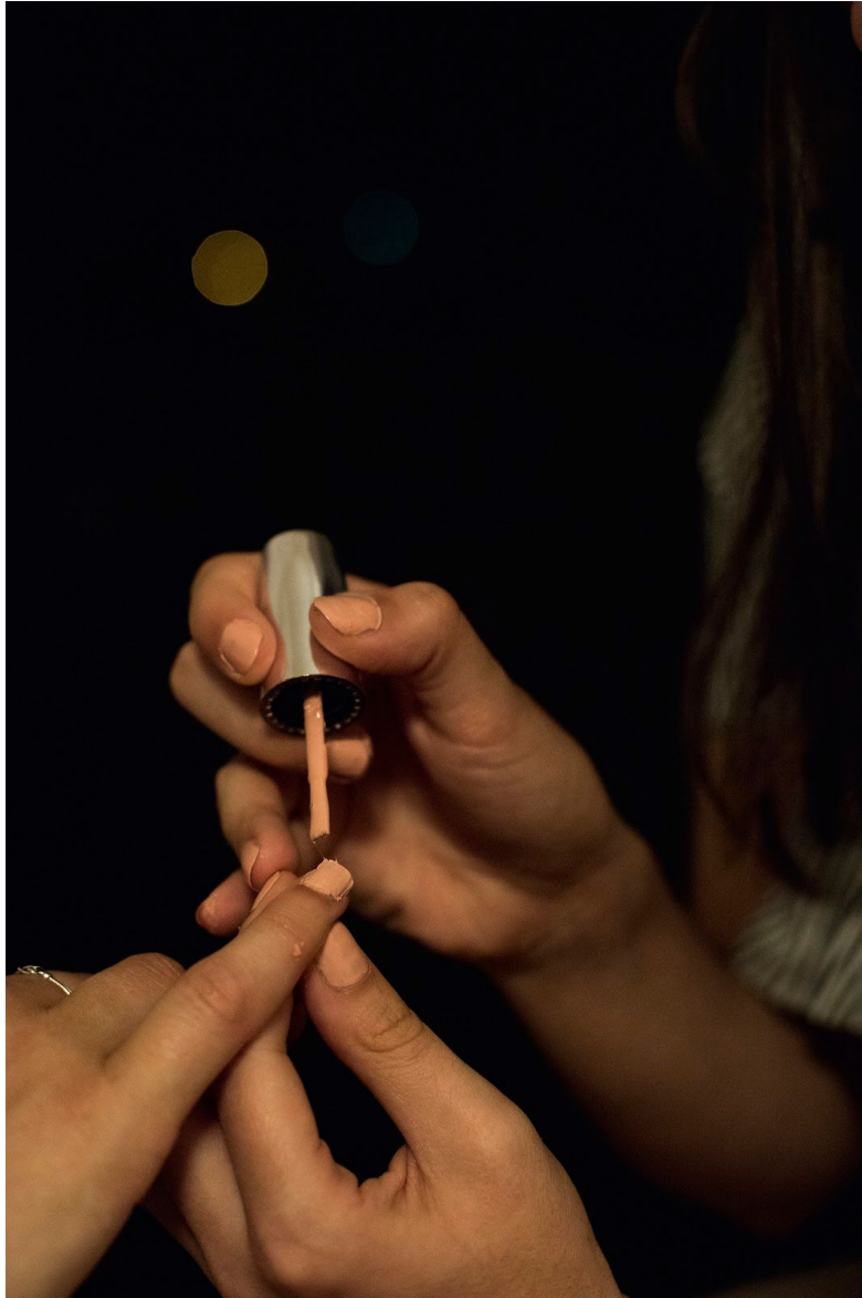
"Nail Performance" (I)