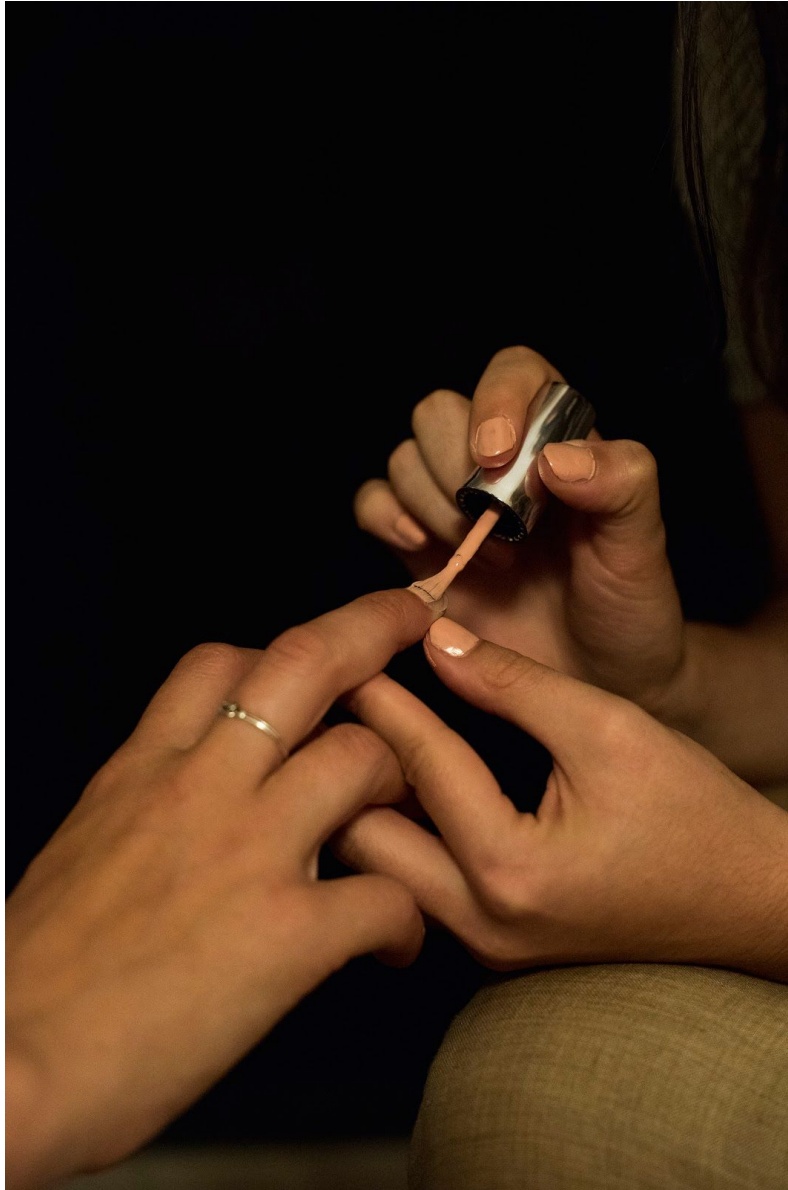
"Nail Performance" (II)