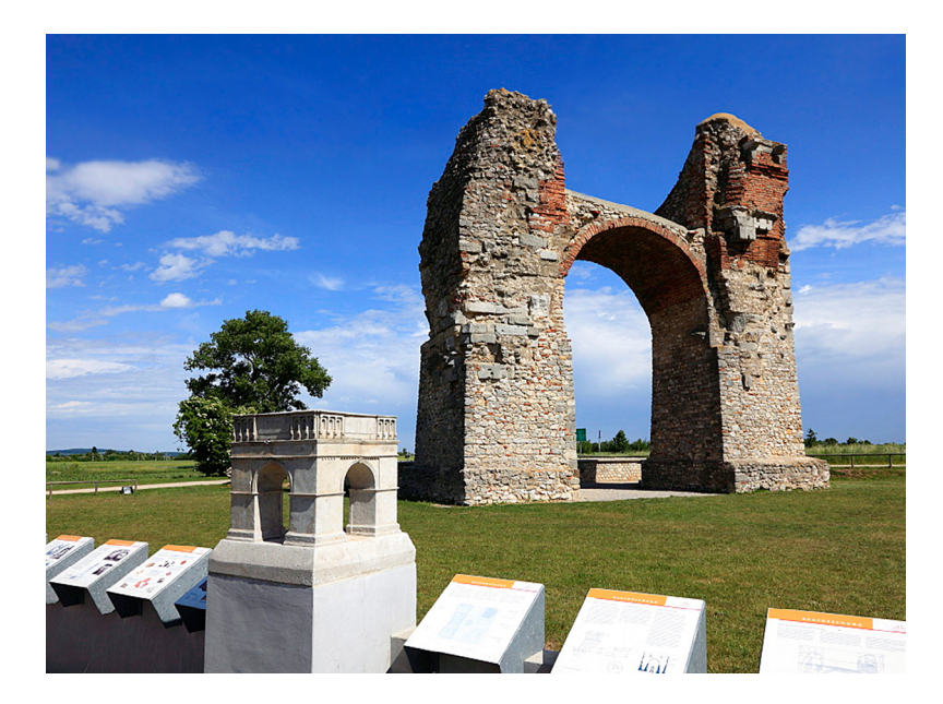
Figure 6 - The ghost structure on the ruins of the Roman Fort Gate of Iža.

5) ghost structures; this communicative practice, in a more innovative and non-myopic vision of intervention, could find a discreet use also for the theatre of Eraclea Minoa, for example integrating a coverage similar to that of the Caesaraugusta theatre, but in which the metallic supports should "reproduce" the walls and the scaenae frons of the theatre, symbolically and communicatively recalling the original shape of the architectural complex, while maintaining a "significant" transparency that allows the reading of the archaeological remains exactly as they were in the past, including the subsequent restoration interventions, they have delivered them to us; see a similar Italian example realised for the early Christian Basilica of Siponto, i.e. a today's evolution of a more remote experimentation, that testifies more "discreet" examples, such as those made for the Temple of Apollo in Veio, the exhibition of Crypt Balbi in Rome and the Roman Fort in Iža (Slovakia) (Figure 6);