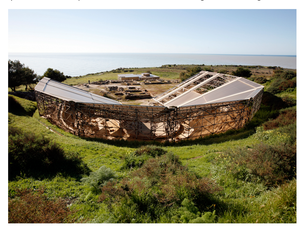
Figure 1 - The Eraclea Minoa Theatre and its current coverage (Photo: C. Gazzitano).

From the current conditions observation of the theatre of Eraclea Minoa, and on the basis of the aforementioned international experiences, also considering other musealization practices adopted in different archaeological sites (not strictly connected to classical theatres), it is possible to identify some project proposals, which provide a series of 'minimal and indispensable' communication solutions, precisely aimed at reading and interpreting the remains of the theatre and its historical-social context. A work of this nature cannot obviously disregard the evaluations carried out by a multidisciplinary team, which is the only one able to keep the specific problems of an archaeological site under control and suggest the most appropriate solutions; this can include the aspects related to the accessibility, to the landscape and the indispensable historical-archaeological knowledge.