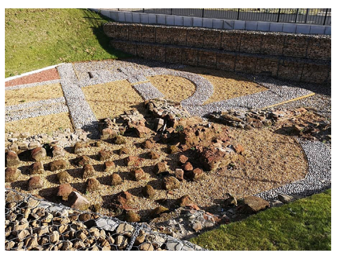
Figure 3 - Care of ruins and lining-out practices applied on the Segedunum Roman Fort, Bath (Photo: A.R.D. Accardi).

2) lining-out. In the wake of the symbolic recovery, not strictly directed towards the reconstructive practice, it is possible to use one of the most effective archaeological communication systems, that is the minimal form of memorization constituted by the so-called marking on the ground, or better identified as lining out practice, one of the capable strategies to symbolically represent the planimetric development of the 're-buried', or only identified, walls. A concrete and not abstract intervention category, which follows the geometry of a plant in a slavish way. This intervention would consist in aligning metal, stone or concrete slabs, as well as other materials, which, laid on the ground above re-buried archaeological structures, would reproduce the masonry system, so as to make it intelligible the connections between the theatre, its hidden parts and the rest of the ancient surrounding urban fabric; see, for example, the Archäologischer Park Köngen (Baden-Württemberg), the site of Segedunum Roman Fort and Bath (Wallsend) (Figure 3), Archaeological site of Empúries, (Catalogne), Roman villa of Rockbourne (Hampshire);