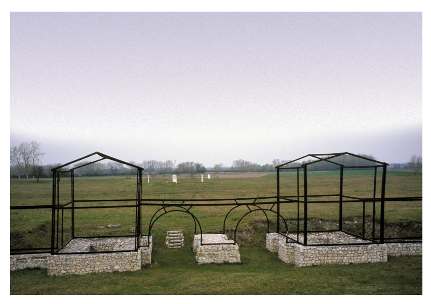
Figure 4 - Graphic panels and reconstruction model at the Carnuntum Archäologischer Park.

4) trompe l'oeil ; at the turn of a signage service and a more refined system of "abstract presentation", the so-called trompe-l'oeil are one of the most successful museographic devices, since they offer a good imaginative solution to recall the entire original buildings volume, but also wider contexts or entire landscapes. This is usually a transparent screen-printed sheet, on which the skeleton of the monument in question volume is represented. Each visitor, positioning on the indicated point, can match the drawing of the building with the emerged masonry layout, according to a game of transparencies and overlaps. This technique, considered by John Stubbs an 'abstract presentation' (Price, 1995, p. 73-90), produces a communicative effect same as a three-dimensional 'ghost structure', but in two-dimensional version. About trompe l'oeil see the site of Gisacum (Eure), the Heidenthor of the Archäologischer Park Carnuntum (Petronell, Niederösterreich), Archäologiepark Belginum (Morbach, Rheinland-Pfalz), the site of Novioregum (Charente-Maritime), the Aguntum Archäologischer Park (Dölsach) (Figure 5);