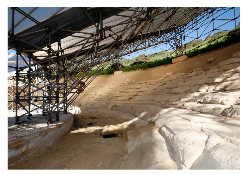
Figure 2 - The Eraclea Minoa Theatre: view on the degraded steps.