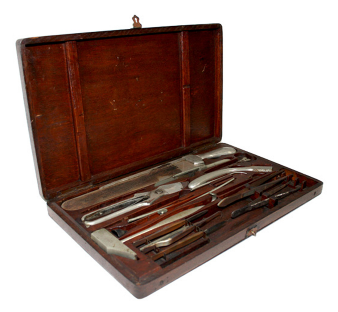
Figure 2 - Museum collection item - autopsy suitcase.